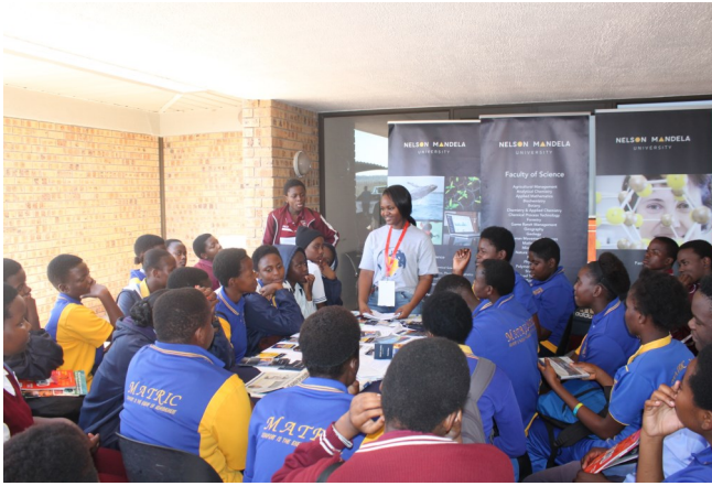
PhD candidate sharing information about the various science programs at Nelson Mandela University.