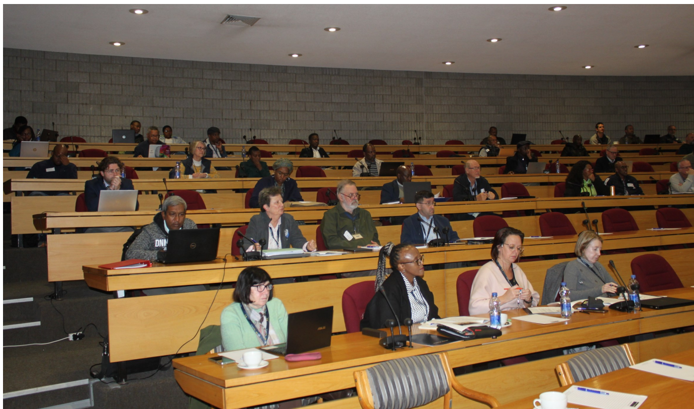
Faculty of Science Curriculum Renewal Participants at the North Campus Conference Centre