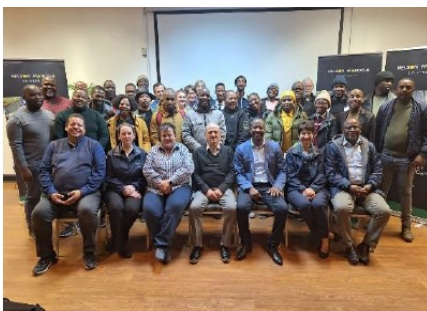
STEM Resourcing & Maths Training of Teachers in the Free State in May 2023.

The ultimate goal is to improve STEM education and ensure learners in the Rural Gariiep District receive a high-quality education that prepares them for the challenges of the modern world.