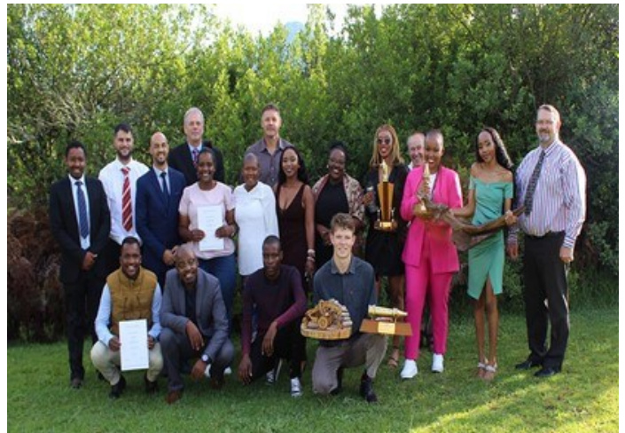
These are the top performers and staff members in Forestry, Wood Technology, and Veldfire Management at Nelson Mandela University

We applaud each of these individuals for their remarkable accomplishments and extend our heartfelt congratulations on their well-deserved recognition. May their achievements serve as an inspiration to the entire Nelson Mandela University community."