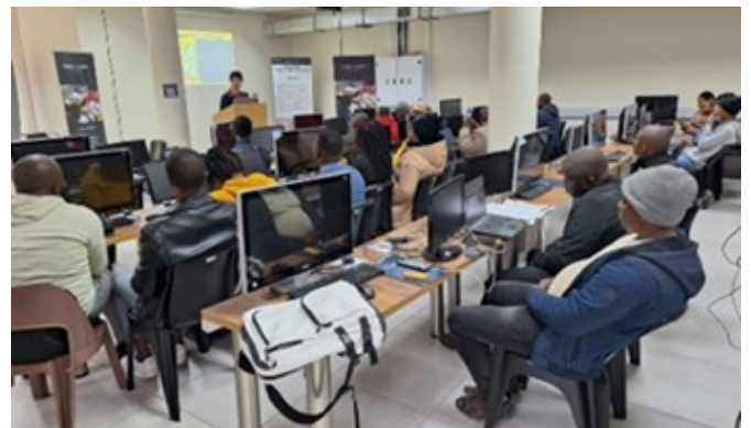
STEAM Education Capacity Training of Staff & Students at WSU in May 2023