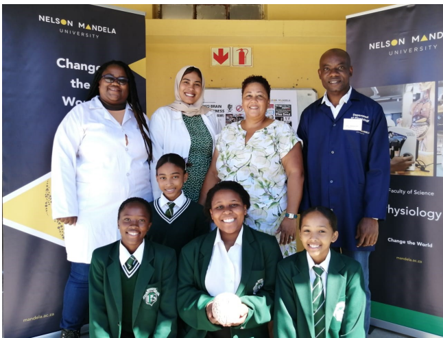
In March 2023, the Neuroscience Research Team (NRT) and the Human Physiology Department of Nelson Mandela University's Science Faculty joined forces to organize their first annual Brain Awareness Week (BAW) event.