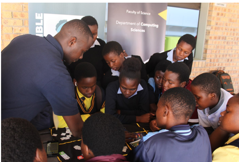
High school learners from Niani Circuit learning how to code.

The program attracted a diverse range of schools from across the Vhembe District. Over the course of four days, 57 schools had the opportunity to participate, with each day dedicated to specific circuits and clusters within the district. The engagement spanned Niani Circuit, Tshilamba Circuit, Vhembe West, and the Nzhelele Education Cluster, ensuring a comprehensive reach throughout the region.