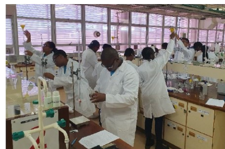
A busy chemistry lab - just look at the concentration on their faces as the iGEMS Grade 12 students perform titrations.

“Make science come alive through hands-on active learning experiences”