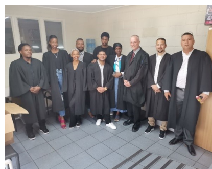
Students receiving their SLP certificates at Heraeus.