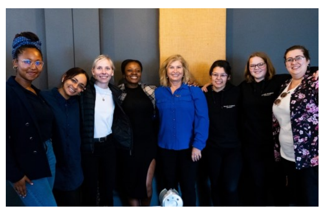
YAWiC presenters with the grade 10 and 11 girls

The feedback from the learners was that they were excited about exploring their unique skills and were inspired and motivated to pursue a career in the field of Computing Sciences at Nelson Mandela University.